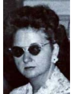
Good Girl/Bad Spy?

8. It was mostly women (a team of almost 10,000) who worked here to try to break the Nazi Germany's secret codes during WWII!