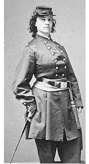
Man or Woman?

6. This leading lady impersonated a male soldier so she could spy for the Union Army during the Civil War.