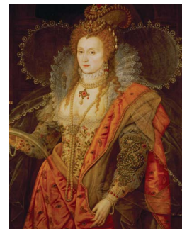
Queen Elizabeth I, Spymaster?