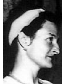
Virginia Hall, WWII Spy